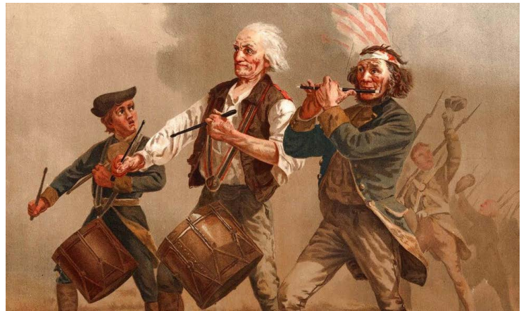
Archibald Willard's painting "Spirit of 76" depicts drummers and fifers in the Revolutionary War.

Traditional military field music in the United States is older than the nation itself, as it arrived with the first colonists and was used much in the same way it had been in Europe: to signal a call to arms to the local militias. Military drummers and fifers played important roles in both the Revolutionary and American Civil Wars, as musical instruments were the most effective ways to communicate and convey orders to troops in a chaotic environment. In the Civil War, they even began signaling orders for daily tasks like when to wake up, mealtimes, and the end of the day.