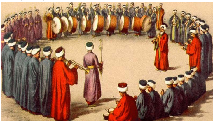
An Ottoman Mehter Band

Today in the United States, marching band music conjures images of pep rallies, football games, color guard dancers, and lively parades, but modern marching bands can actually be traced to Turkish military drum corps formed over two thousand years ago. These drummers, whose group eventually developed into a full band and was later named the Mehter Band under the Ottoman Empire (14th – 20th centuries), would march with the military bearing their flag and ensign as a signal of support for the soldiers as well as a celebration of victory. Through their military conquests, these Turkish bands spread their traditions from Central Asia to Asia Minor and eventually the Islamic states. The Mehter Band continues to play concerts and ceremonies in Turkey today and is the oldest band in the world.