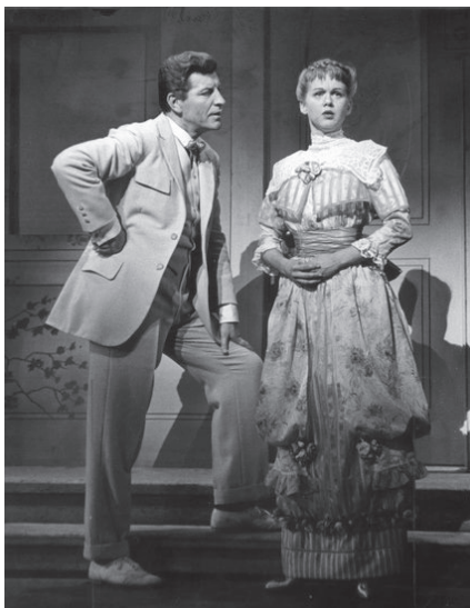
Robert Preston and Barbara Cook in the original Broadway production.

There have been several revivals of the show in New York, including two brief runs at New York City Center in 1965 and 1980, but most notable is the 2000 Broadway revival, which was directed and choreographed by Susan Stroman and starred Craig Bierko and Rebecca Luker. In 2003, a television movie was made of the show, which starred Matthew Broderick as Harold Hill and Kristin Chenoweth as Marian.