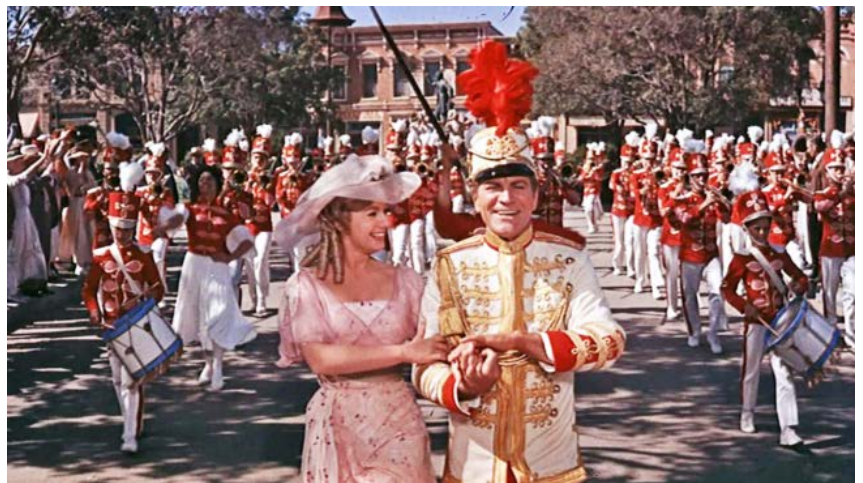
Shirley Jones and Robert Preston in the 1962 film adaptation.