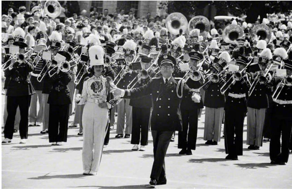
Meredith Willson leads 76 trombones in a big parade.