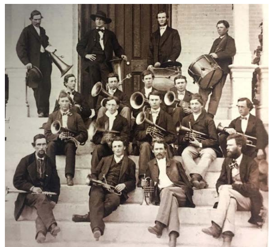
The University of Notre Dame Band

During peacetime, military bands were most prominently employed for public ceremonies and special occasions, and it was during one such period that the first college band was formed in the United States. In 1846, the University of Notre Dame band played at the university's first graduation ceremony, only four years after the institution's founding. Music lessons were an integral part of the curriculum from the first days of the university in 1842, and the band continues to be a point of pride for the Fighting Irish today as the oldest college band in continuous existence in the country. Similarly to the military bands of the time, the university band played for special occasions and ceremonies, but the marching band identity as we know it today emerged with the advent of organized football. While the first recognized game was in 1875 at Harvard University, Notre Dame played its first game in 1887 and was accompanied by the university band, which has not missed a home game since. Twenty years later in 1907, the University of Illinois band staged the first modern half-time show with a robust marching band taking the field. The practice took off at colleges around the country and is now a staple of home football games.